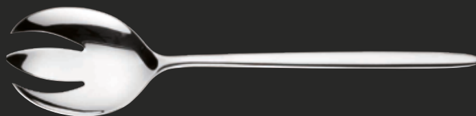
Forchetta insalata Salad fork cod. 24000015 cm 26,0