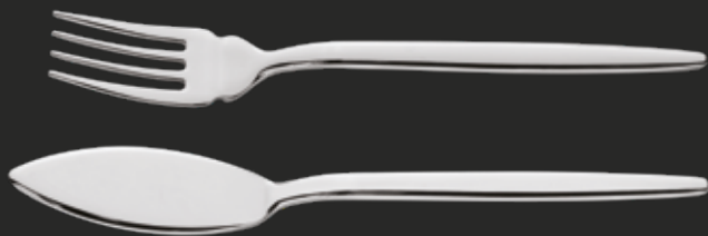
Forchetta pesce Fish fork cod. 24000028 cm 19,1