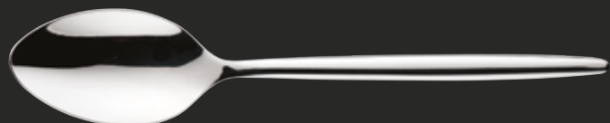
Cucchiaino tavola Table spoon cod. 24000001 cm 21,0