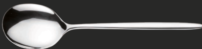
Cucchiaino insalata Salad spoon cod. 24000014 cm 26,0